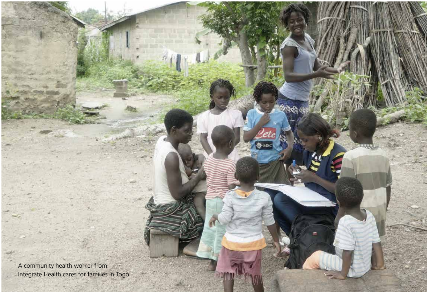
A community health worker from Integrate Health cares for families in Togo.